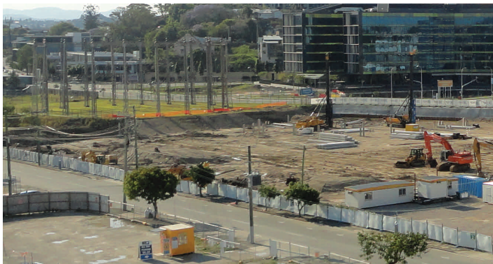
Gasworks (Woolworths) - View from Como