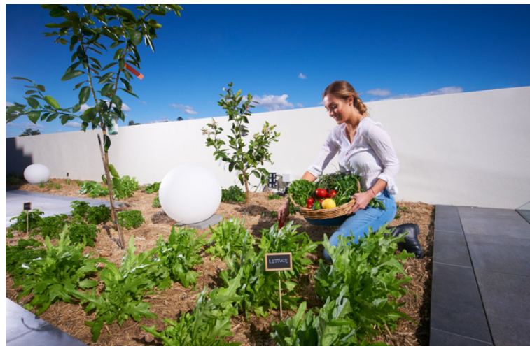
Como Vegetable Garden