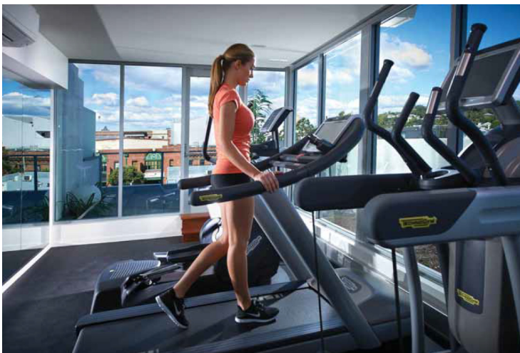
Gym equipped with state of the art Technogym equipment

Cavcorp is providing all buyers (if required) with the opportunity to purchase a tax depreciation report for your apartment. To obtain a report please complete & return the attached form with payment to Cavcorp's office by 31st July 2012 to ensure you don't miss out! (Cost $350 + GST)